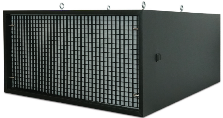
*Replacement product for the Mark10