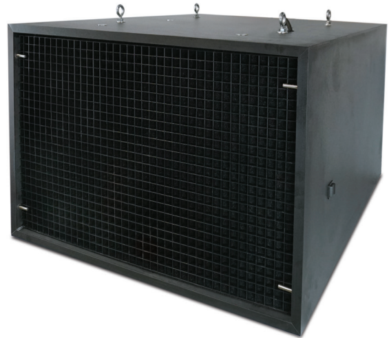
*Replacement product for the Mark15