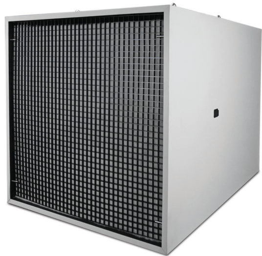
*Replacement product for Mark20